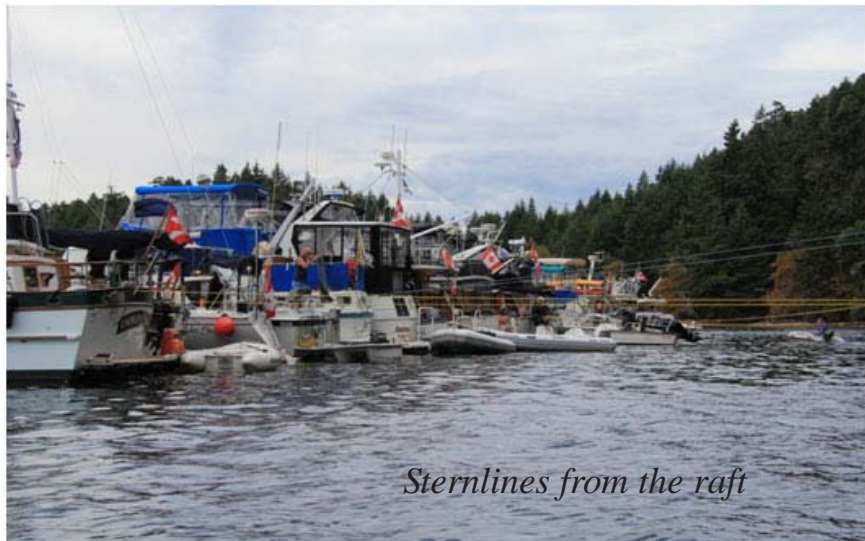
Sternlines from the raft

Cidery for a cider tasting. The weekend wrapped up with a BBQ & potluck on Sunday evening.