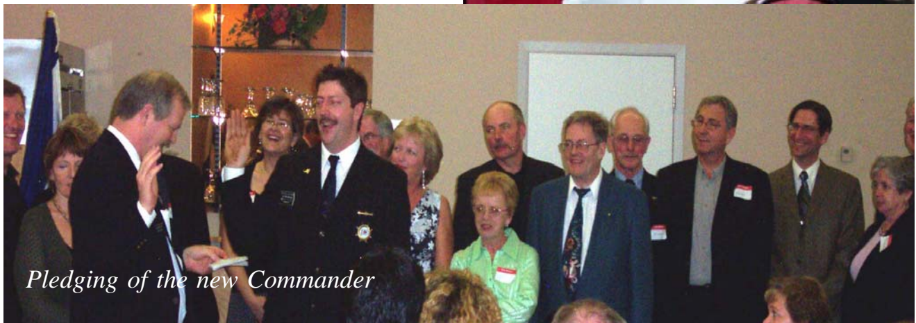
Pledging of the new Commander