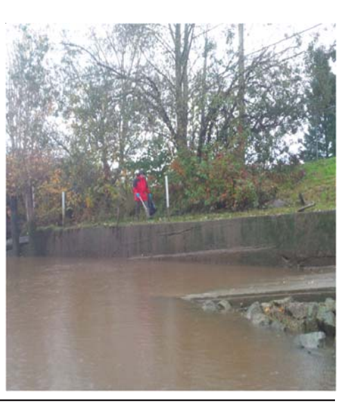
Langley DATUM DATA, December 2015- Page 7