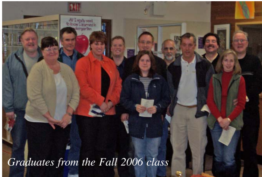
Graduates from the Fall 2006 class

In January 11 students of our Fall Boating class joined our Squadron!